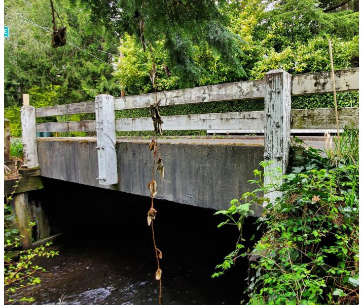
Thornton Creek Bridge No. 104 on NE 105th St at 40th Ave NE

See reverse for a map showing the location of each bridge.